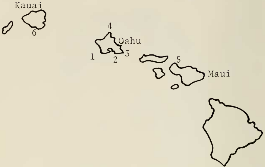
FIGURE 3. Map of Hawaiian Islands showing the collecting sites of Rhyssoplax linsleyi on the islands of Oahu, Maui, and Kauai: (1) Puu o Hulu (type locality), (2) Ala Moana, (3) Wainanalo, (4) Kuhuku Point, (5) Honolulu, and (6) Poipu Beach.

scales typical of Chitonidae. This girdle is cream with green bands except on the solid colored specimens, where the girdle matches the valves in color.